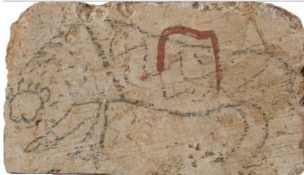
Fig:(17) Representation of a lion on a stone block, Oxyrhynchus, Inv. no. 572

After: García, J. J.; Mascia, L. (2023), fig.4, p.42