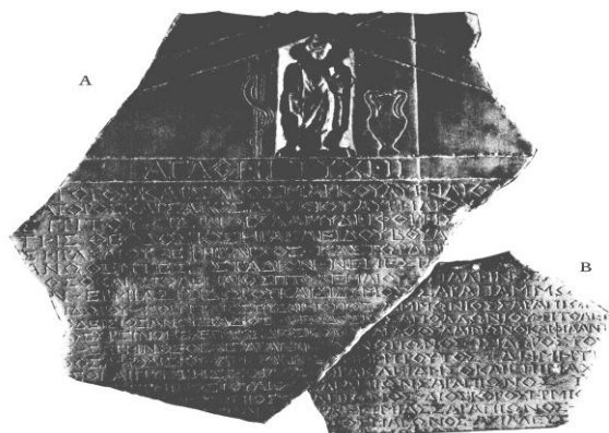
Fig. (14): Ephebic inscription from Antinoopolis, 162-163 A.D After: Rigsby, K.J. (1978).