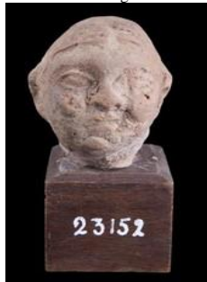
Fig.(5) a. Caricature head (grotesque), terracotta, Graeco-Roman Period (332 BCE-395 CE), preserved Antiquities Museum in Bibliotheca Alexandrina, Inv.no. 23152