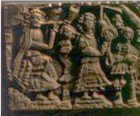
Fig.(1) a. Decorative wooden relief depicting a musical band

After: Hanna, E., (2019), figs 20-21, PP.69-70.