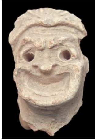
Fig.(4)a. Theatrical mask, terracotta, Roman Period, Alexandria, El-Hadara, preserved Antiquities Museum in Bibliotheca Alexandrina, No. 0409 After: https://antiquities.bibalex.org/Collection/Detail.aspx?a=409&lang=en