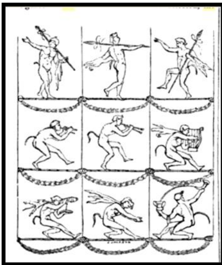
Fig.(2) The engraving represents one of the nine figures seen dancing on the tightrope in a painting of Herculaneum