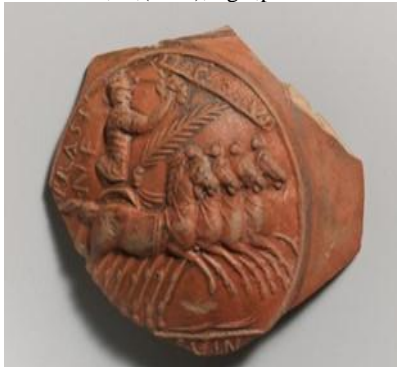
Fig. 12 Terracotta medallion depicts a charioteer in his quadriga, holding the victor's crown and palm branch- late 2nd-early 3rd century A.D.- The Metropolitan Museum of Art 17.194.2125 After: https://www.metmuseum.org/art/collecti on/search/250464