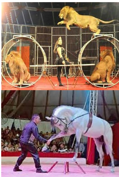
Fig:(18) Horses and lions shows, Circus of Al-Helw,Alexandria

After: https://english.ahram.org.eg/News/255050.aspx