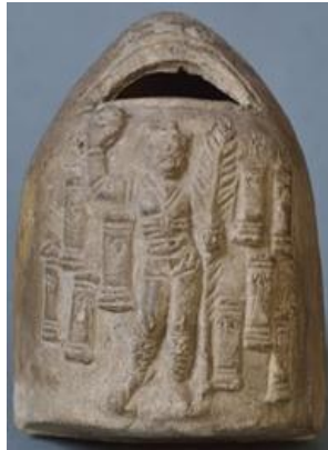
Fig.10 Money box with representation of a victorious charioteer. Late first to early second century A.D. Ceramic. Gotha, Stiftung Schloss Friedenstein, inv. no. Ahv.A.K. 97. After: Bell, S.,(2020),Fig.7,p.194