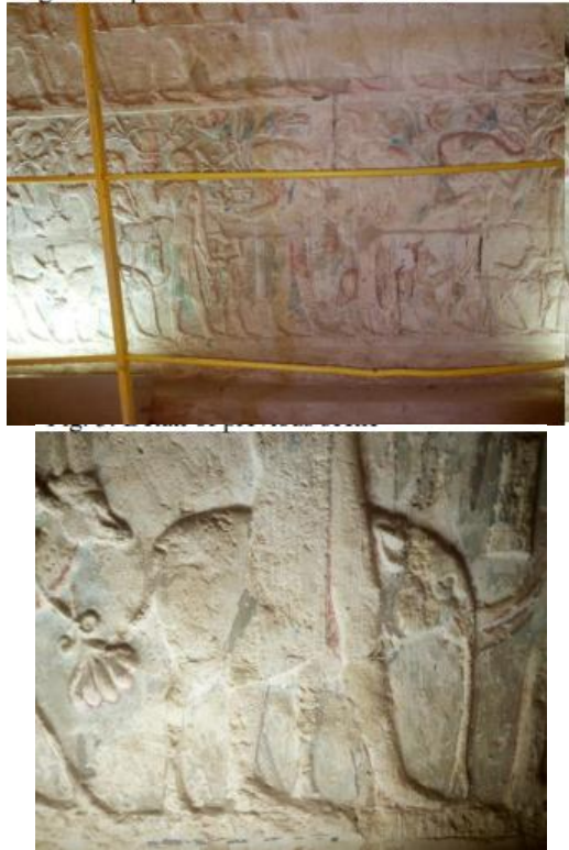
Fig:15 Elephant scene in Petosiris Tomb After: Ahmed, D., (2019).Fig,4,5,p.30