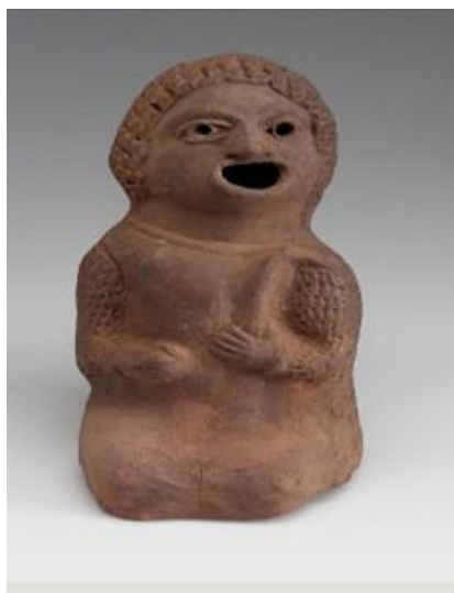
Fig.(3): Comic figurine, terracotta, Roman period,, Egypt, Ihnasya el-Medina (Herakleopolis Magna), House E05.266