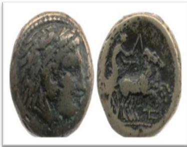
Fig. 9A A chariot pulled by two horses, Copper alloy, 310 BC-301 BC., Alexandria, British Museum After: https://www.britishmuseum.org/collection/object/C_1921-0213-196 :Accessed in: 10/8/2021 at 9:00 pm