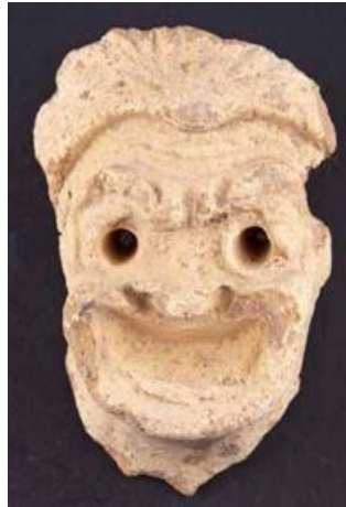
Fig.(4)b. Theatrical mask, terracotta, Roman Period, Alexandria, El-Hadara, preserved Antiquities Museum in Bibliotheca Alexandrina, No. 0455