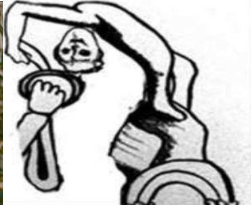
Fig.(1) b: Detail of a decorative relief showing a clown

After: Hanna, E., (2019), figs 20-21, PP.69-70.