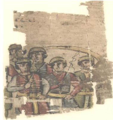
Fig.11 Fragment of An illustrated Greek papyrus from Antinoe, 500 A.D After: S Gąsiorowski, J., (1931),.pl.I