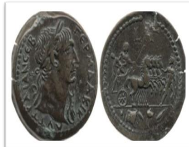
Fig.9 B A chariot pulled by four horses, Alloy, 97-117 A.D., Alexandria, British Museum. After: https://www.britishmuseum.org/collection/object/C_CR-5378 ; Accessed in: 10/8/2021 at 9:00 pm.;Poole, Reginald Stuart (1892). Catalogue of the coins of Alexandria and the Nomes . London: Trustees of the British Museum.p.49