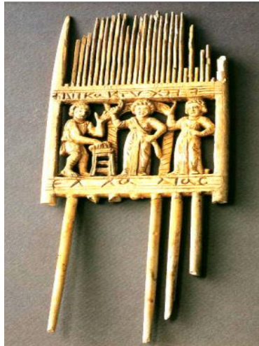
Fig.(6): Comb with representations of three mime dancers, 5 th century, from Antinopolis, preserved at the Louvre Museum No: E 11874

After: Rutschowskaya, M.H., (2000), Peigne à coiffer . In L'Art copte en Égypte: 2000 ans de christianisme , Paris: Institut du Monde Arabe and Éditions Gallimard, 222, No. 277.