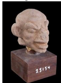
Fig.(5) B. Caricature head (grotesque), terracotta, Graeco-Roman Period (332 BCE-395 CE), preserved Antiquities Museum in Bibliotheca Alexandrina, Inv.no. 23154